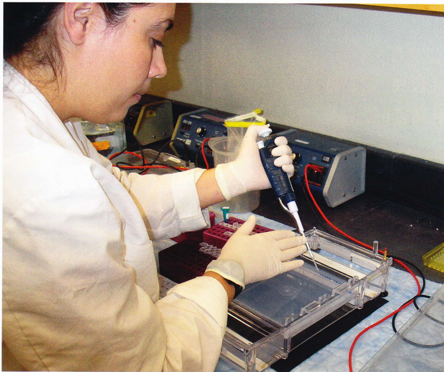
Specific testing methods may vary among labs that participate in ring tests, but results must not.